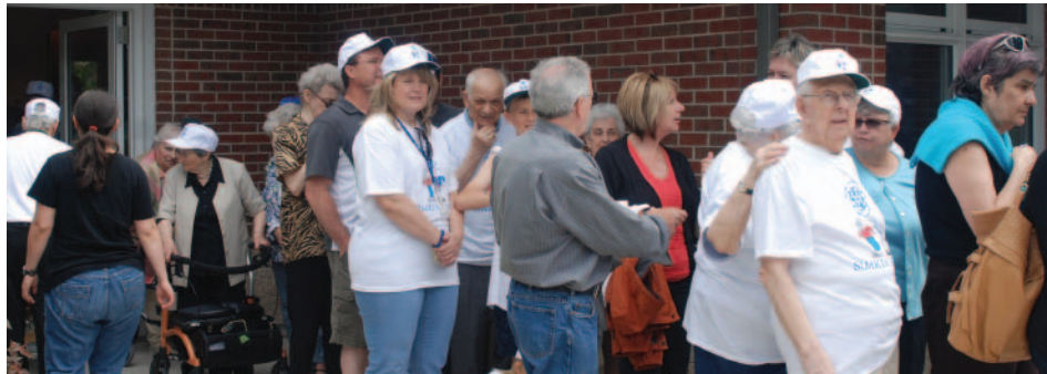
GUESTS LINE UP FOR A POST-STROLL BARBECUE.