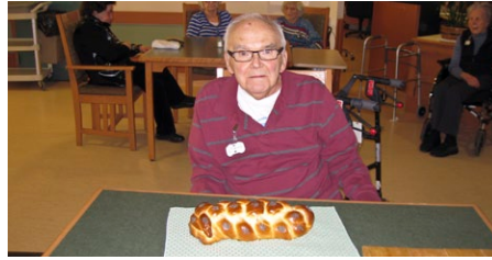
GETTING READY TO CUT THE HOMEMADE CHALLAH FOR SHABBAT.