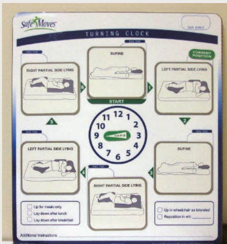
TURNING CLOCKS HELP STAFF NOTE WHEN TO MOVE PATIENTS WHO ARE AT RISK OF SKIN BREAKDOWN.