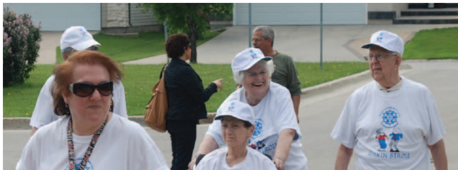
SPORTING SIMKIN STROLL T-SHIRTS, WALKERS MAKE THEIR WAY BACK TO THE CENTRE AFTER A NEIGHBOURHOOD STROLL.

See page 4 for more on the Jewish Foundation of Manitoba.