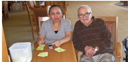
SELLING RAFFLE TICKETS AS A FUNDRAISER FOR RESIDENT COUNCIL, OF WHICH HE IS A MEMBER.