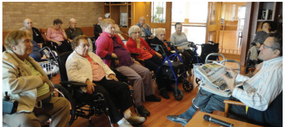
ABOUT TWENTY RESIDENTS USUALLY ATTEND THE DISCUSSION GROUP.