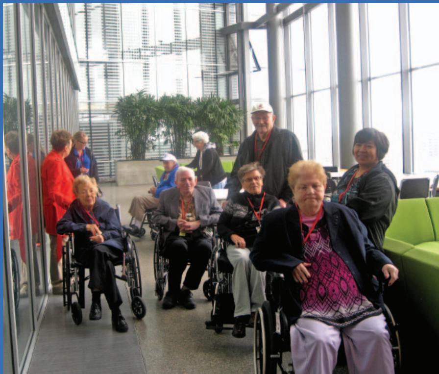
RESIDENTS ENJOYED A TOUR OF THE NEW MANITOBA HYDRO BUILDING DOWNTOWN THIS PAST SPRING.

The Saul and Claribel Simkin Centre 1 Falcon Ridge Drive Winnipeg MB R3Y 1V9 Tel: (204) 586-9781 Fax: (204) 589-7560 Email: info@sharonhome.mb.ca www.simkincentre.ca