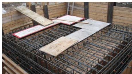
The overflow chamber in progress: the walls are seven metres high and 16 inches thick.